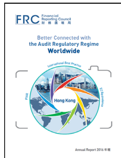
2016 Annual Report of the FRC